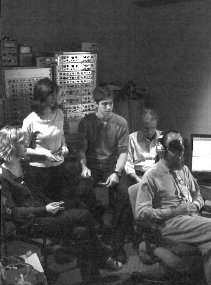
Figure 1. Laboratory arrangement