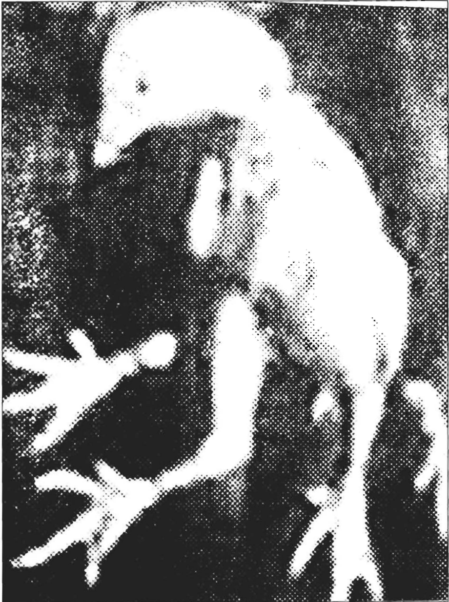
Figure 1. Chicken influenced by Duck energy.